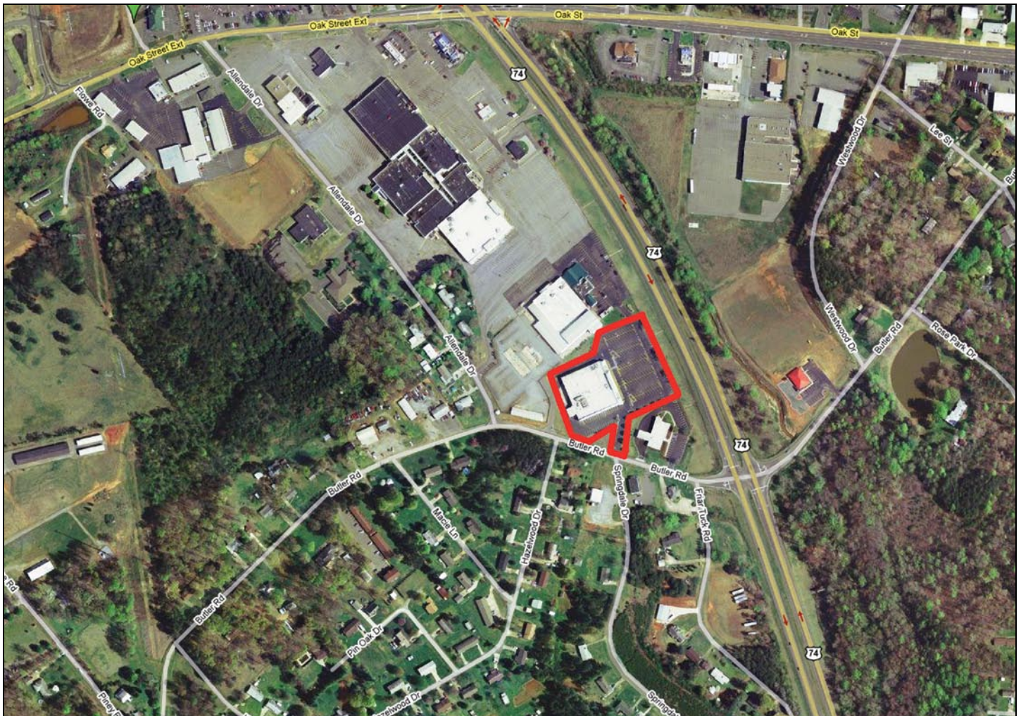
LOCATION: US Hwy 74A at Butler Road adjacent to Tri City Mall — Forest City, NC